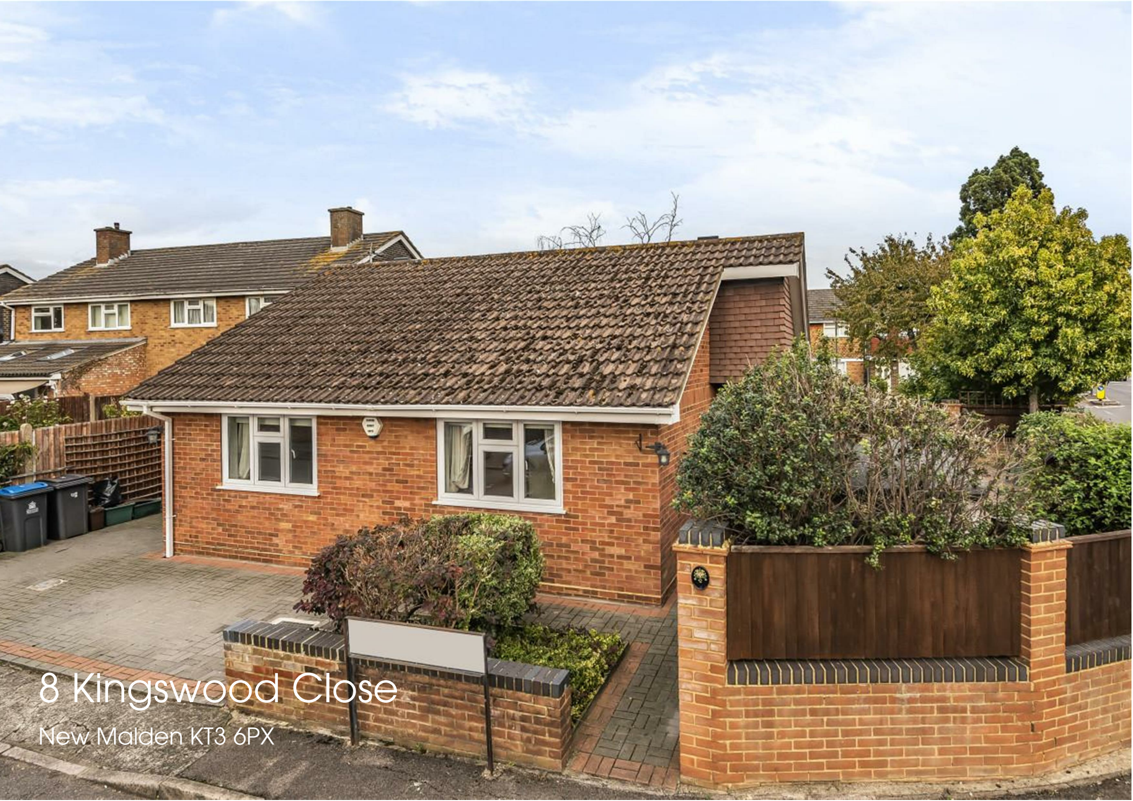
8 Kingswood Close New Malden KT3 6PX